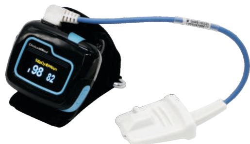
Wireless SpO 2