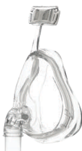
Full face mask